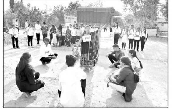
दावतपूर येथे सुरू असलेल्या राष्ट्रीय सेवा योजना शिबिरात ग्रामस्थांमध्ये पर्यावरण संरक्षणासंदर्भात पथनाट्य सादर करण्यात आले.