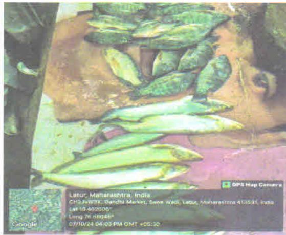
Latur, Maharashtra, India CH2J+W3X, Gandhi Market, Sawe Wadi, Latur, Maharashtra 413031, India Lat 18.402006° Long 76.58046° 07/10/24 04:03 PM GMT +05:30