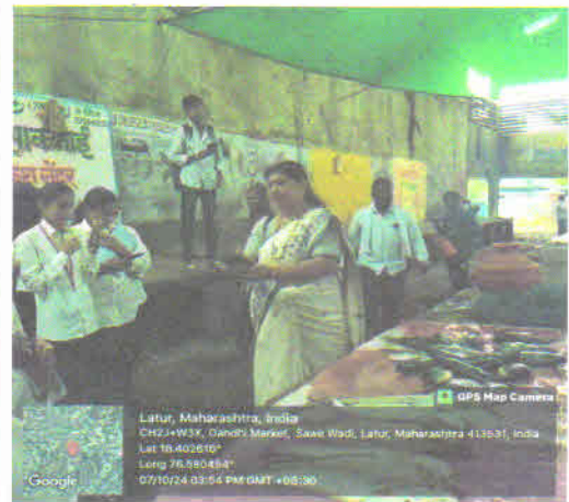
Latur, Maharashtra, India CH2J+W3X, Gandhi Market, Sawe Wadi, Latur, Maharashtra 413031, India Lat 18.402010° Long 76.580459° 07/10/24 03:54 PM GMT +05:30