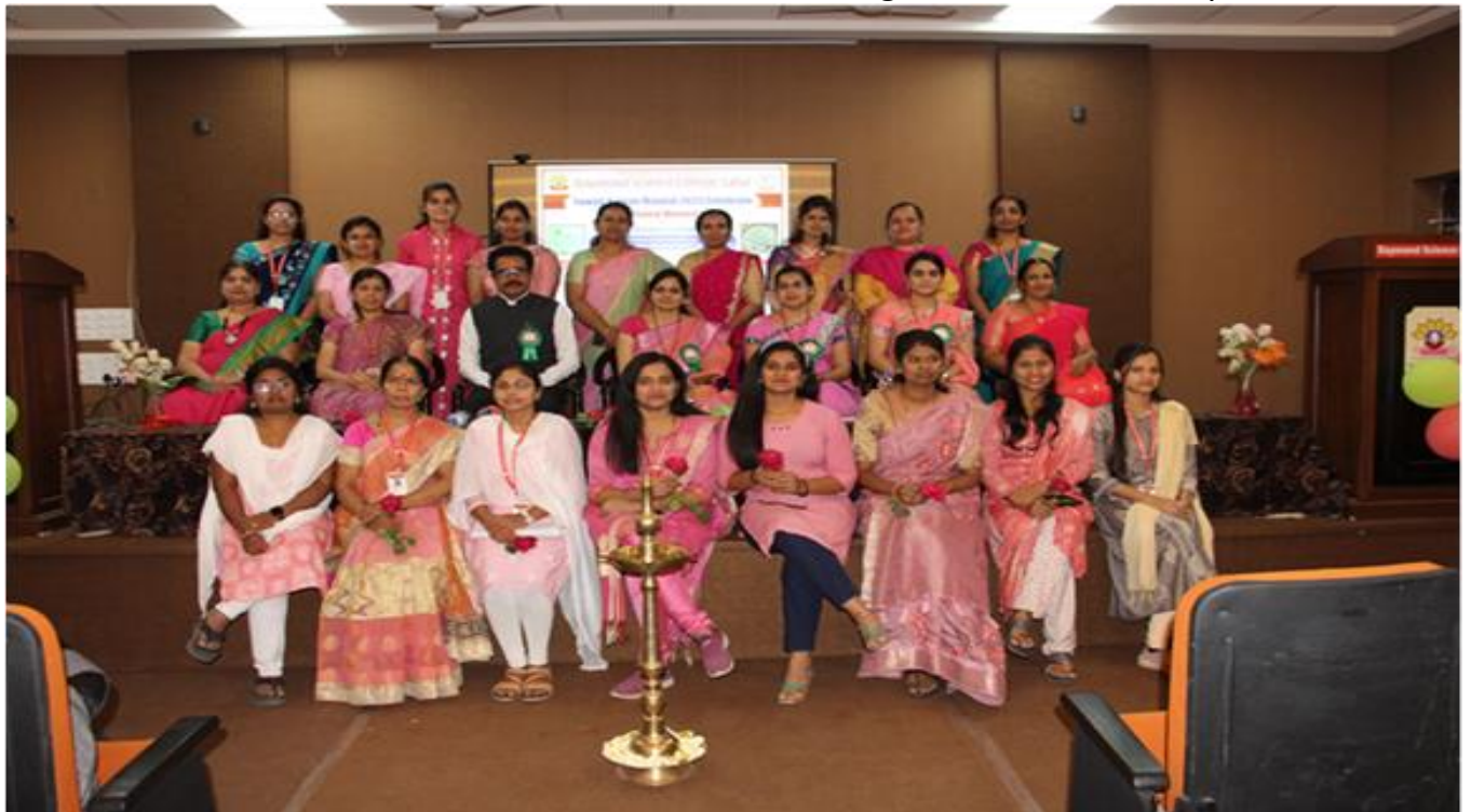
Felicitation of DSCL Ladies Staff On Women's Day