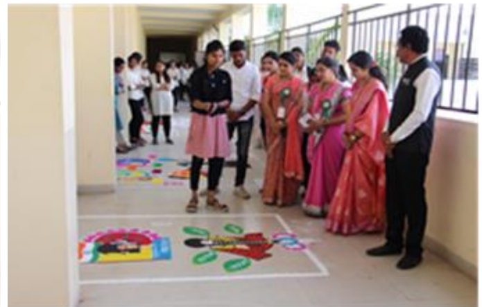
Judging of Rangoli Competition On Women's Day