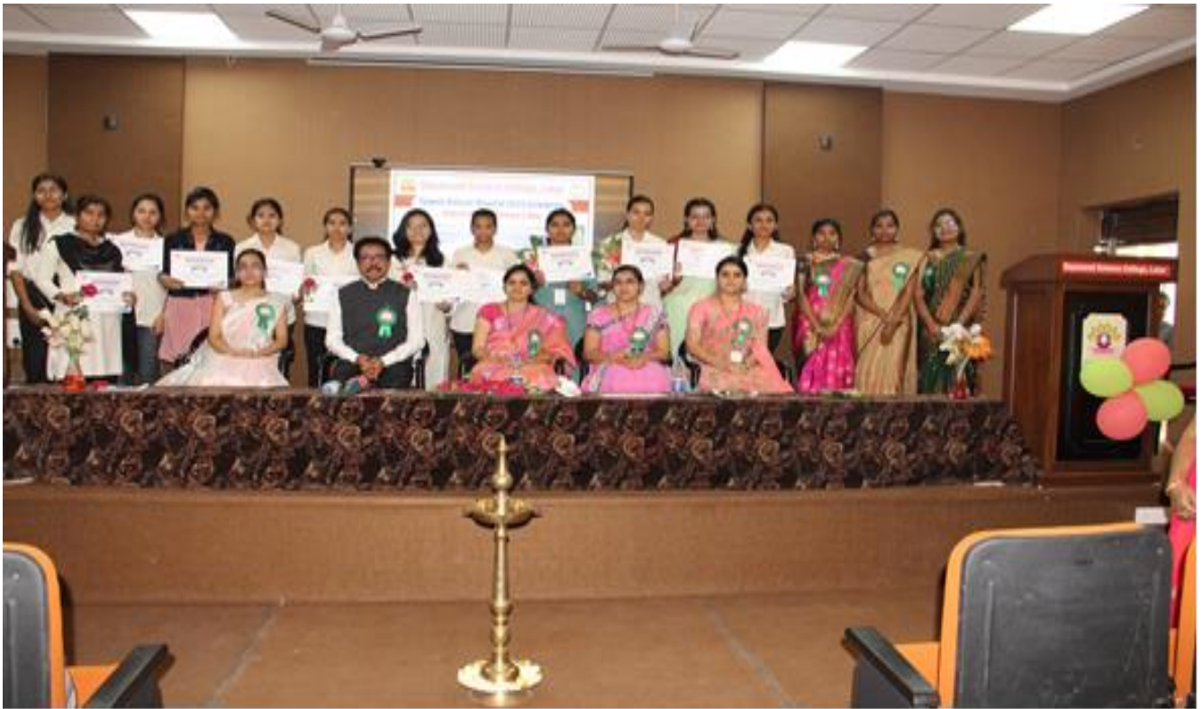
Certificate Distribution of Contestant of Rangoli and Poster Competition

Events organized during the Academic year 2022-23