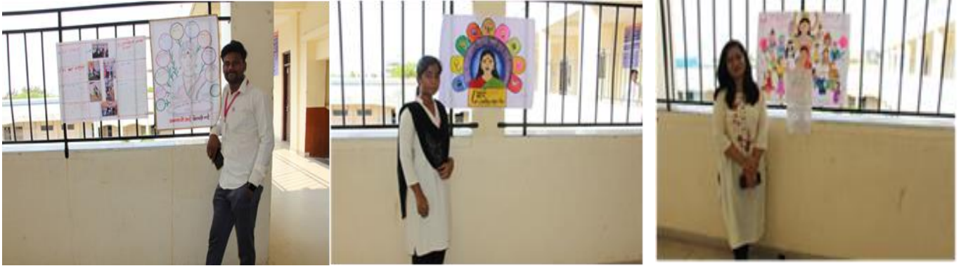
Contestant of Poster Competition On women's Day