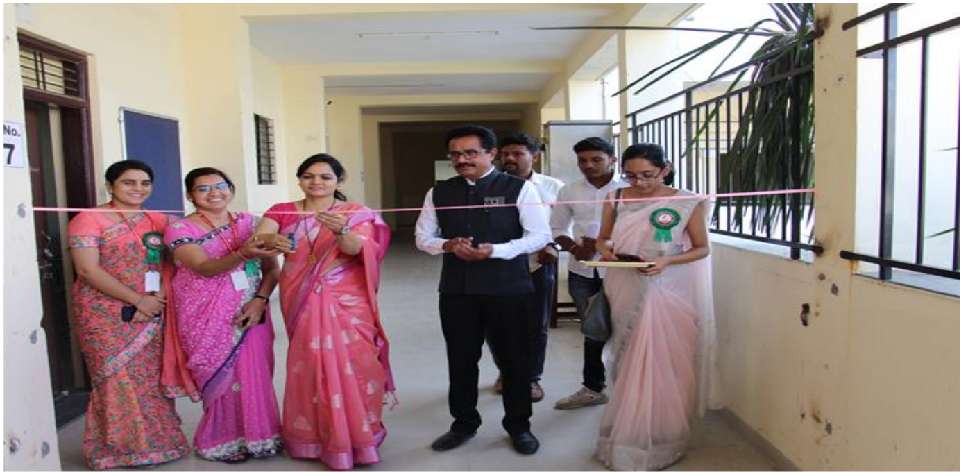
Inauguration of Rangoli and Poster Competition By Ribbon Cutting ceremony