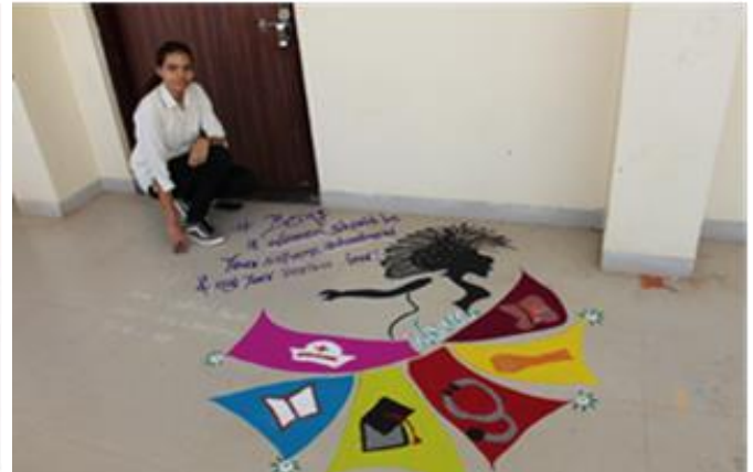
Contestant of Rangoli Competition On women's Day