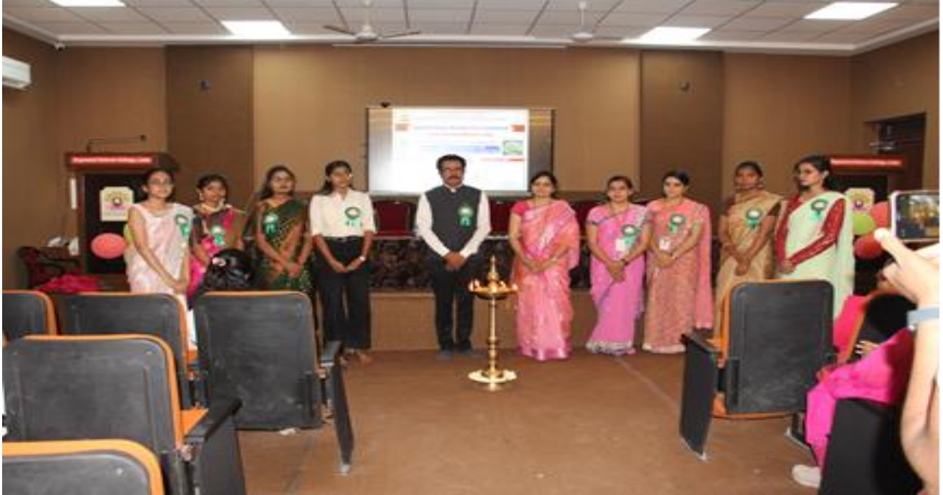
Valedictory Function of Rangoli And Poster Competition On Women's Day