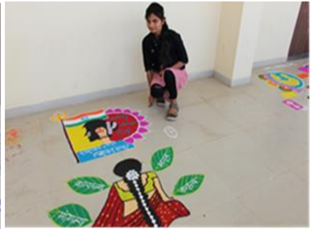
Contestant of Rangoli Competition On women's Day