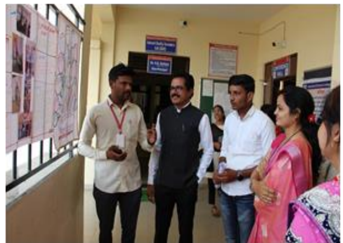
Judging of Poster Competition On Women's Day