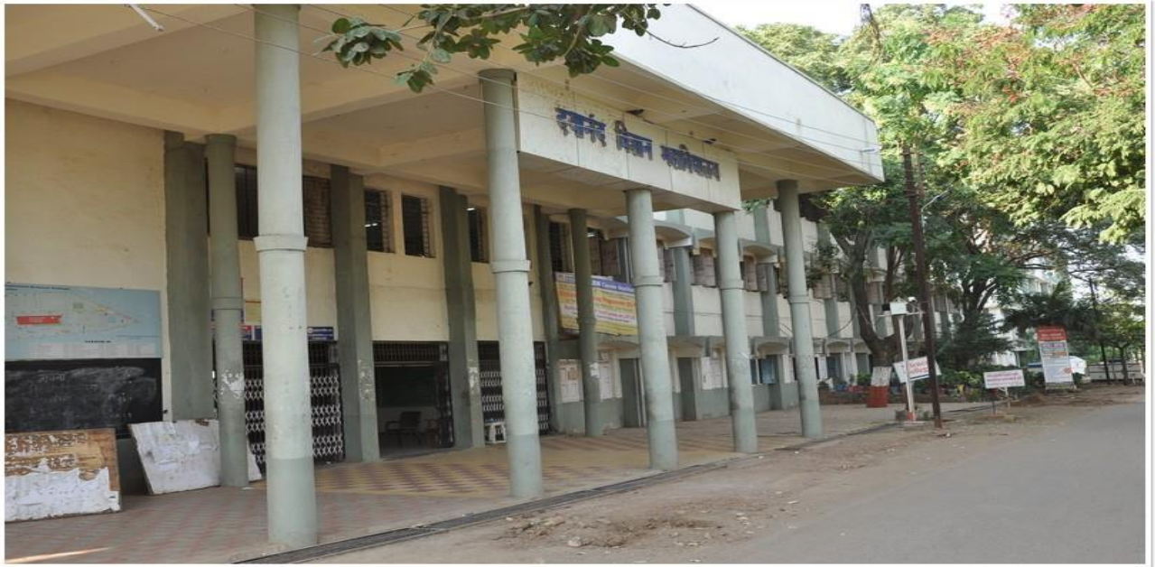
Leotechsa Robotics Pvt. Ltd., Pune