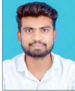
Afish Maske Hockey