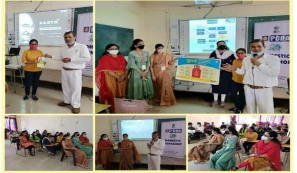
● Energy Saving Awareness Session by Energy Experts