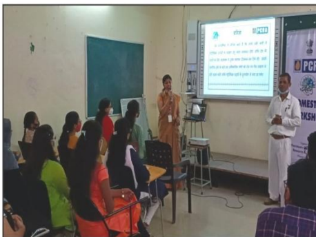
● Energy Saving Awareness Session by Energy Experts

पीसीआरए पेट्रोलियम मंत्रालय भारत सरकार यांचा ऊर्जा संवर्धन उपक्रम