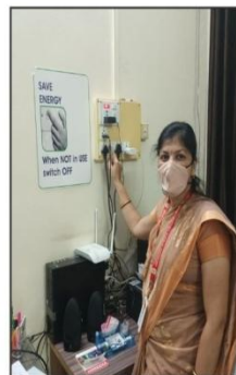
● Sign board Display When NOT in use Pls switch OFF