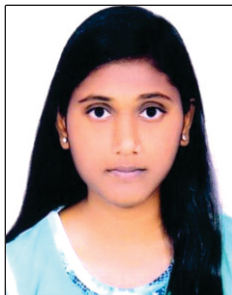
Landge Bhakti Botany