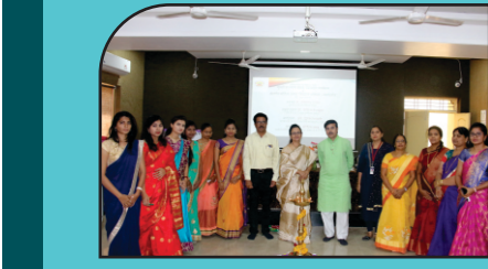
पुस्तकाची विचारार्थी एकमत

दयानंद शिक्षण संस्था, लातूर "आ नो भद्रा कृतवो यन्तु विश्वतः"