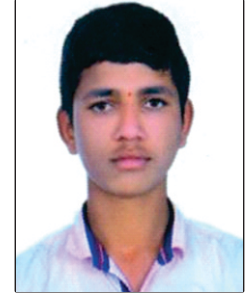
Bhosale Pramod Electronics