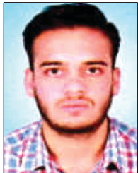
Fulsundar Vishal Industrial Chemistry