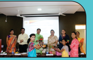
पुस्तकाची विचारार्थी एकमत

दयानंद विज्ञान महाविद्यालयाच्या 'उन्मेष' वार्षिकांकाचे प्रकाशन वार्षिक अंकातून विद्यार्थ्यांच्या कलेचा अविष्कार