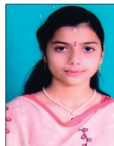
Kaldate Komal Microbiology