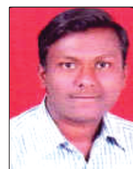
Mumane Nageshwar Electronics