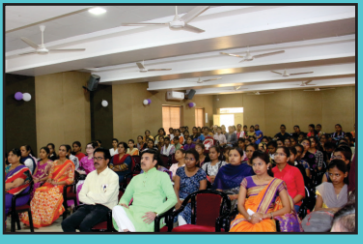
जर्ना संवर्धन आणि स्वच्छतेसाठी समाजाने पुढाकार घ्यावा