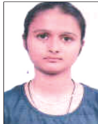
Palsapure Vidhi Microbiology