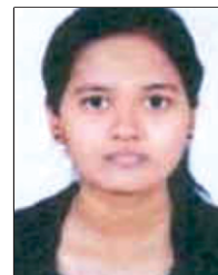
Bonwale Snhehal Electronics