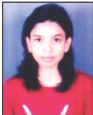
Diksha Tour B.Sc. II