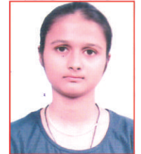
Palsapure Vidhi B.Sc. III