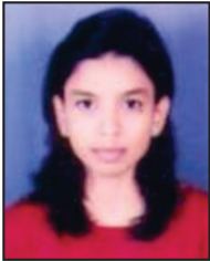
Diksha Tour B.Sc. I