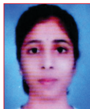
Apeksha Chakote Youth Festival Silver Medal Speech