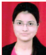
Aishwarya Andhare Speech Competition, Avishkar 2017- Poster Presentation Anweshan 2017