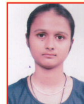
Palsapure Vidhi B.Sc. (English)