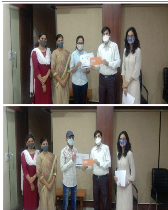
Winners of Eloquence Competition