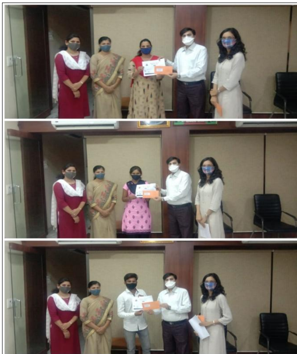
Winners of Debate Competition