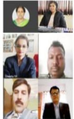
विद्यार्थी, संशोधक, प्राध्यापक बहुसंख्येने उपस्थित होते.