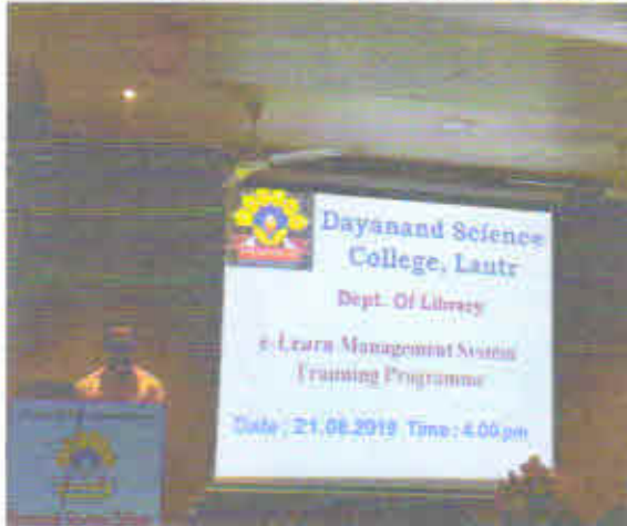
Photographs of 'e Learn Management System' Training Programme.

Events organized during the Academic year