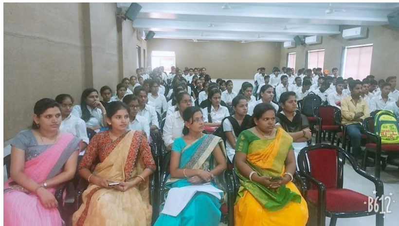
Staff of Computer Science Department & Students Attending the Induction Program on PHP.