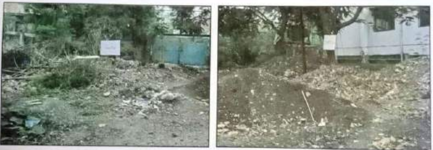
Figure 16: Waste Segregation