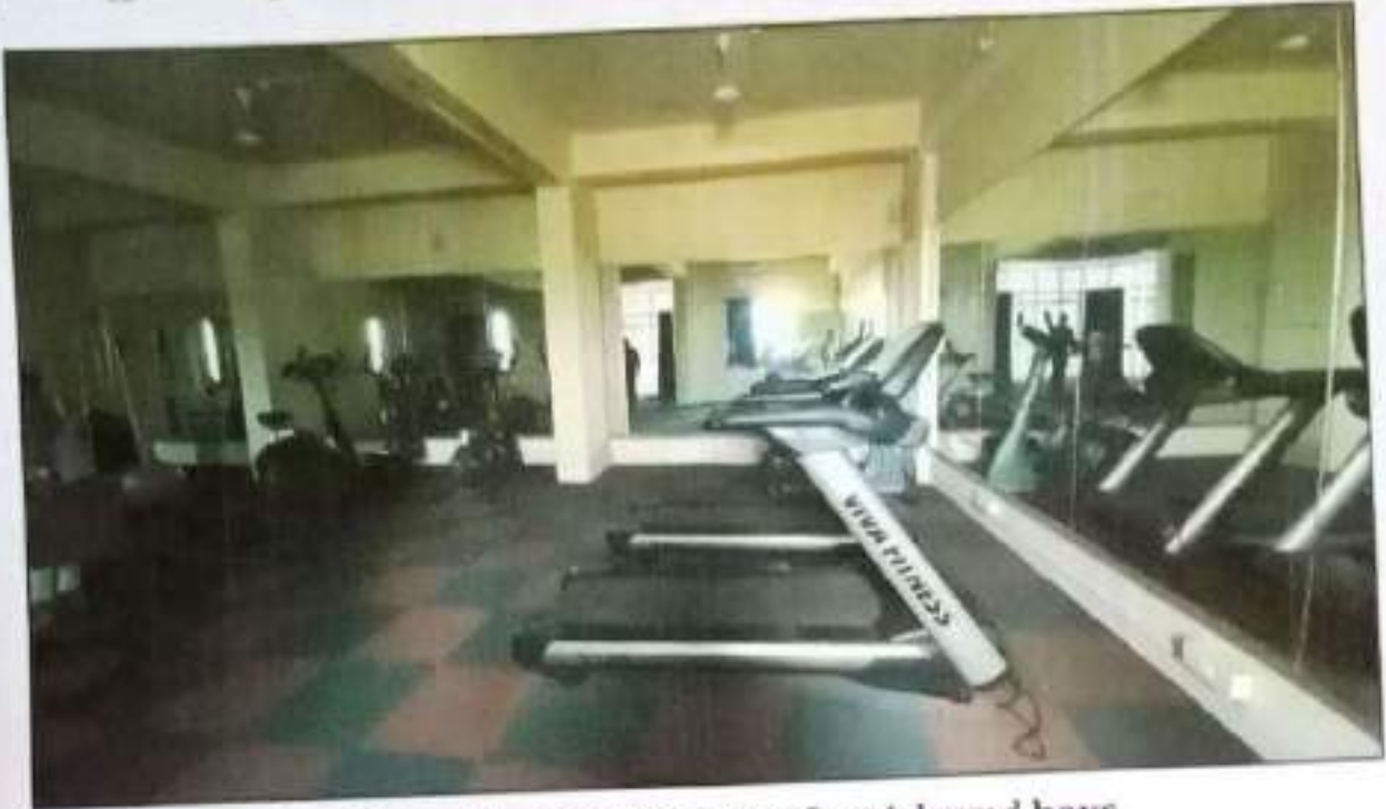
Figure 22: Separate gyms for girls and boys