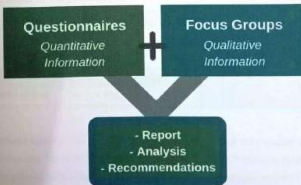
Figure 10: Green Audit Methodology

Based on the data analysis step, some recommendations in the target areas are made. Specific measures are suggested to reduce water and energy consumption. Proper treatments of waste are suggested with respect to waste collection, waste disposal and recycling. Recommendations to reduce the use of fossil fuels are made for the betterment of community health. Proper disposal of hazardous waste is suggested to prevent mishaps. Management also takes into account the suggestions related to reducing their carbon footprint.