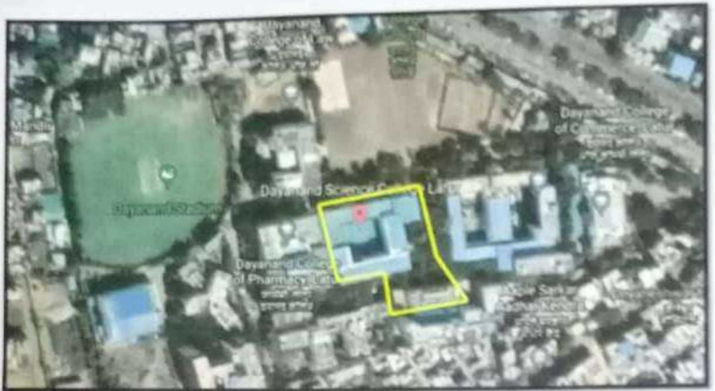
Figure 4: Google Earth image of Dayanand Science College