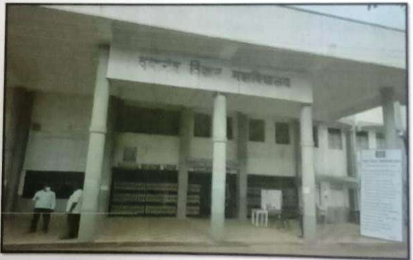
Figure 5: Dayanand Science College