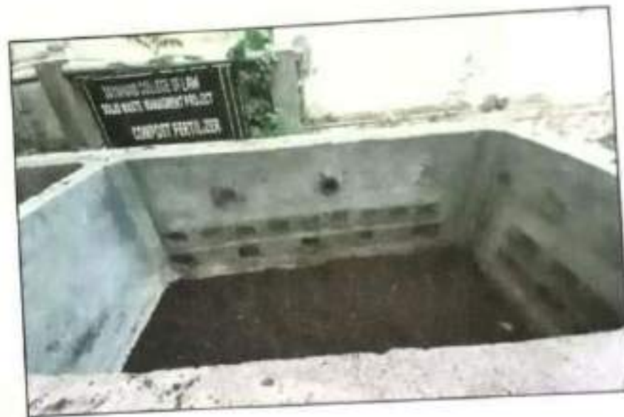
Figure 21: Manure prepared in the Composting