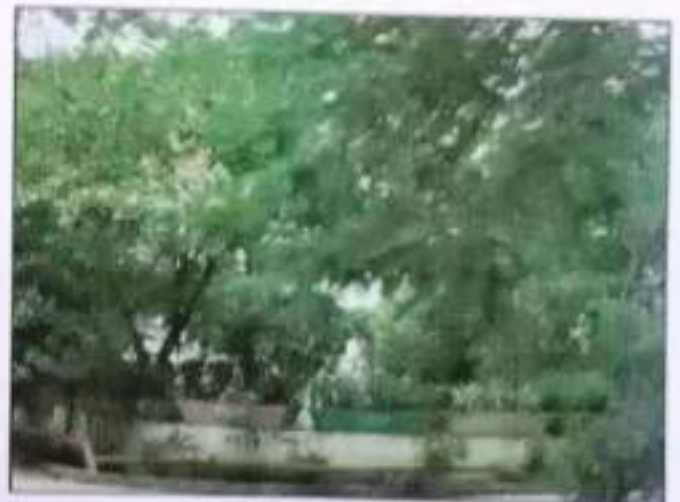
Figure 19: Vegetation in front of Science College