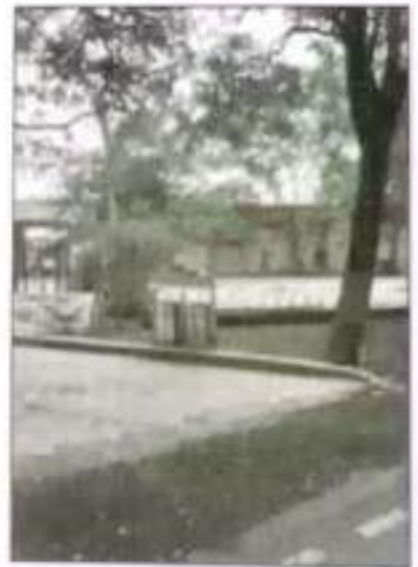
Figure 18: Trees in the Dayanand education campus