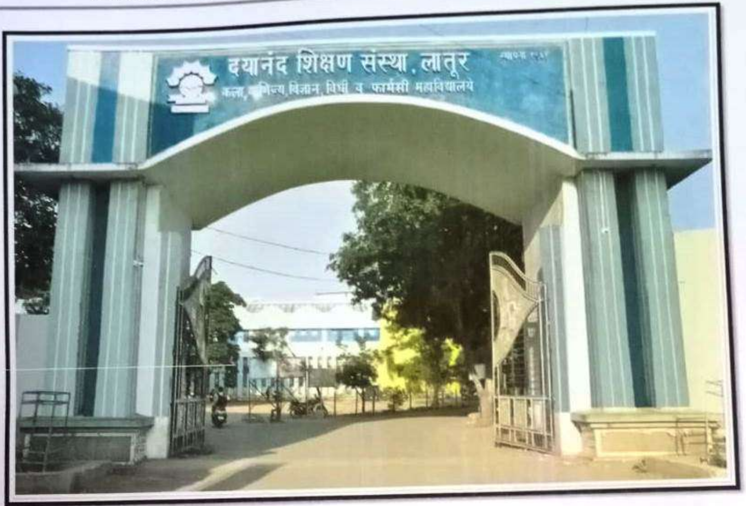
Figure 1: Dayanand Education Society