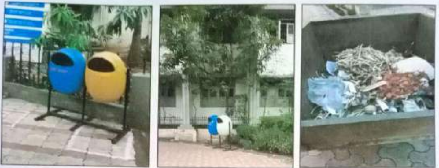
Figure 15: Waste Collection