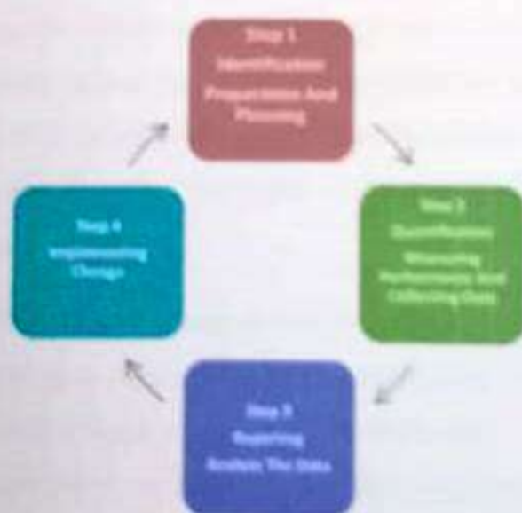
Figure 6: Green Audit

Green audit can be a useful tool for a college to determine how and where they are using the most energy or water or resources; the college can then consider how to implement changes and make savings. It can also be used to determine the type and volume of waste, which can be used for a recycling project or to improve waste minimization plan. It can create health consciousness and promote environmental awareness, values and ethics. It provides staff and students a better understanding of Green impact on campus. Thus it is imperative that the college evaluate its own contributions toward a sustainable future. As environmental sustainability is becoming an increasingly important issue for the nation, the role of higher educational institutions in relation to environmental sustainability is more prevalent.