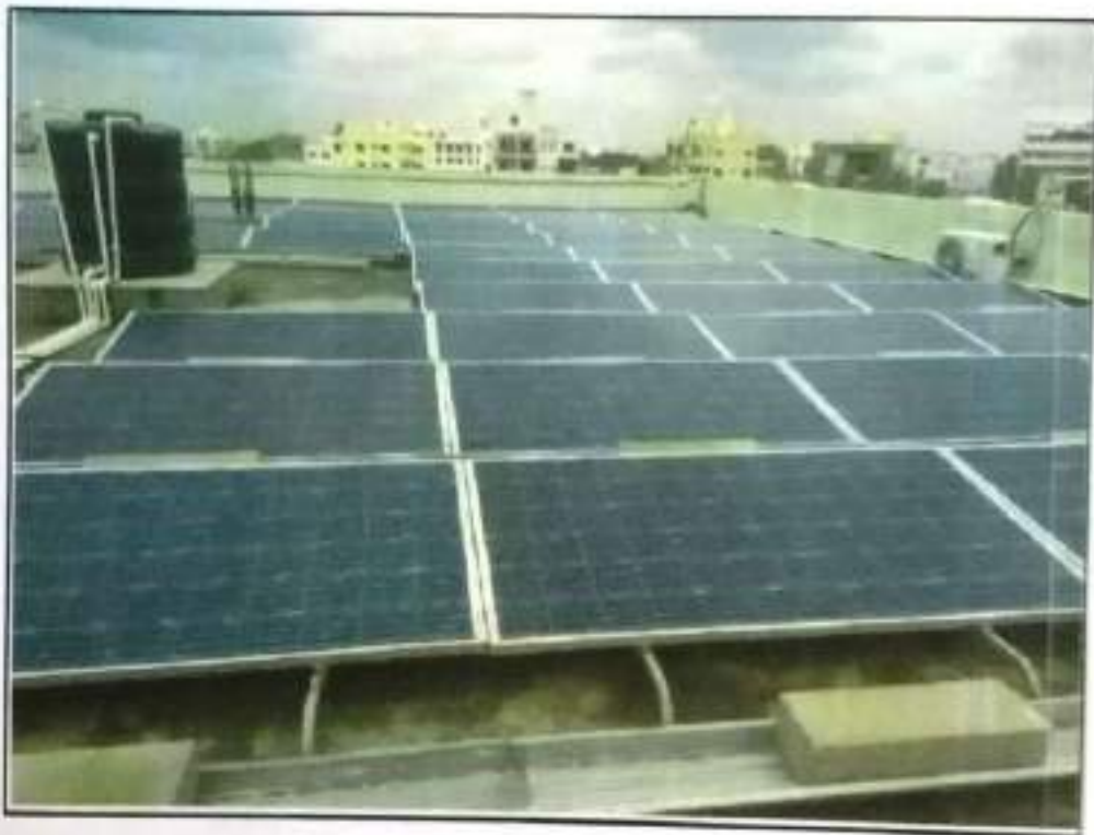
Figure 12: Solar Panels On Rooftop

The Institute has been installed Solar Power Plant.