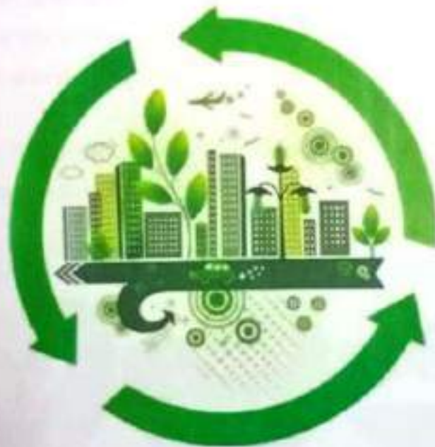
Figure 8: Goal