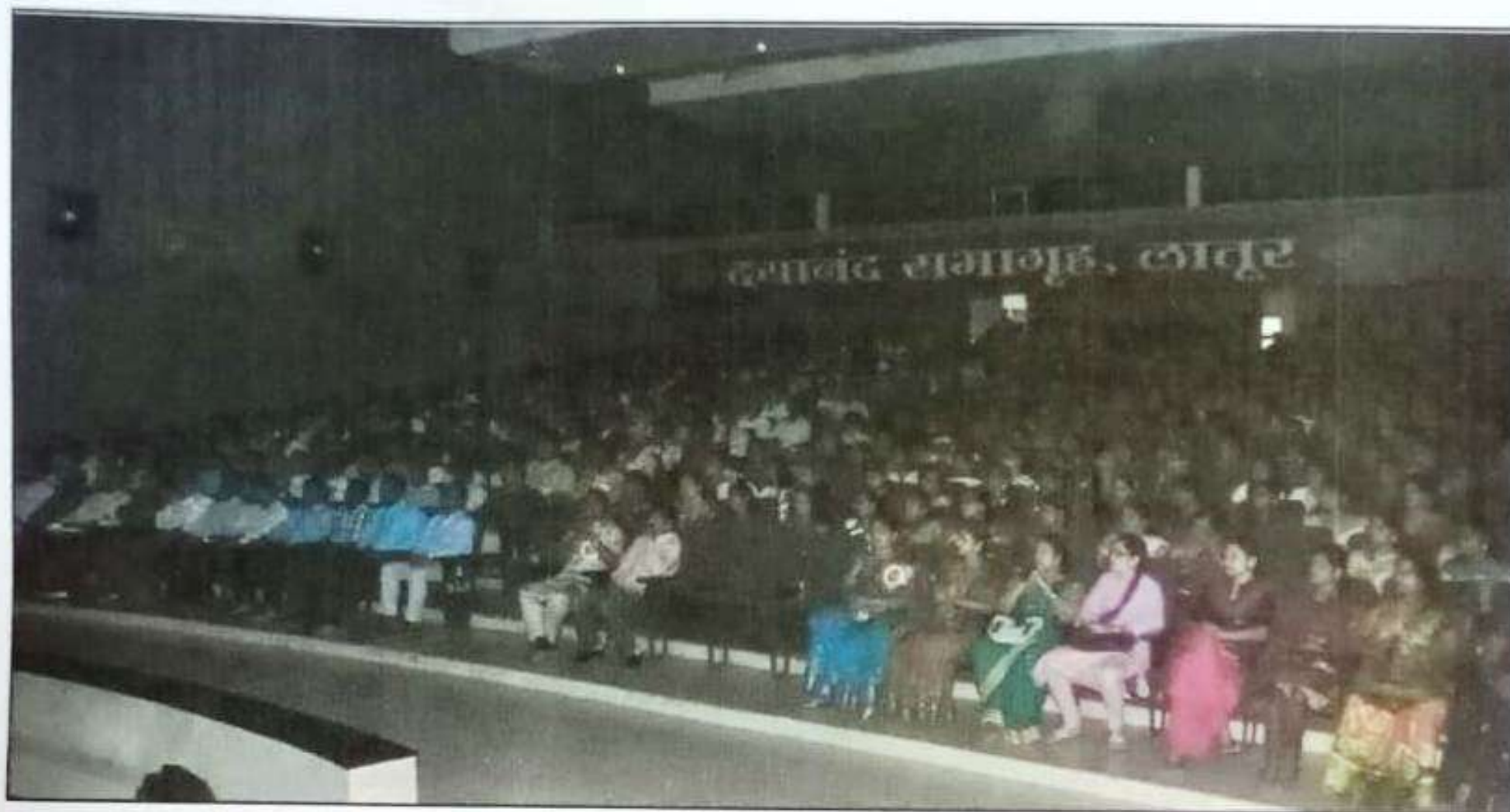
Figure 24: Auditorium