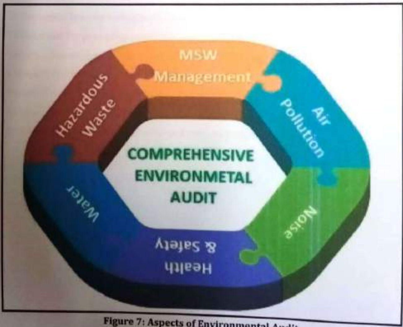
Figure 7: Aspects of Environmental Audit