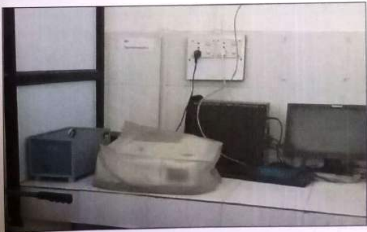
Figure 13: Equipments used in Labs