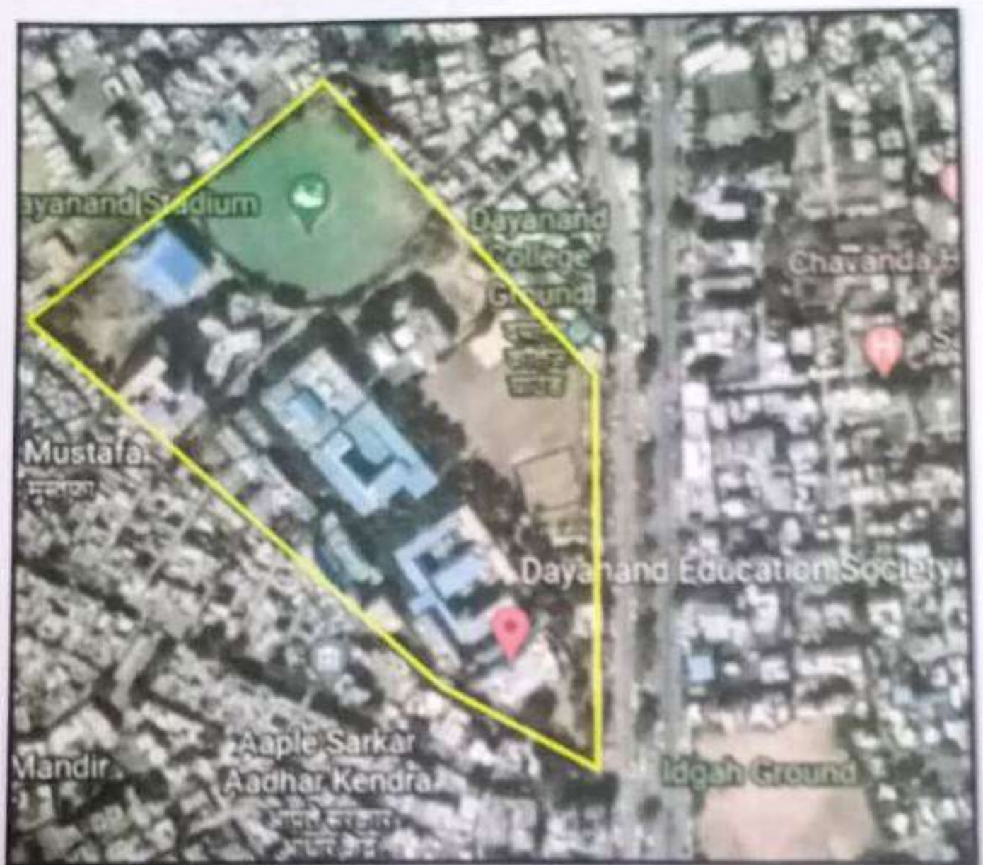
Figure 2: Google Earth Image of Dayanand Education Society