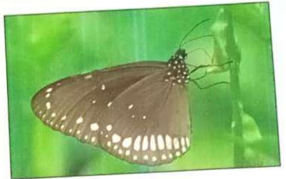
Figure 20: Fauna in the Campus