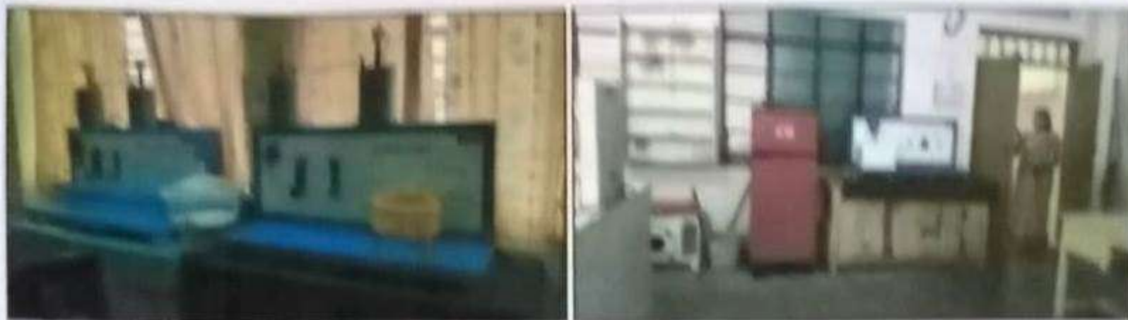
Figure 14: Equipments used in Labs