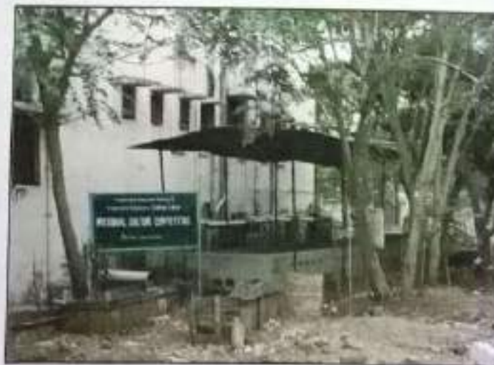
Figure 17: Microbial Culture Composting