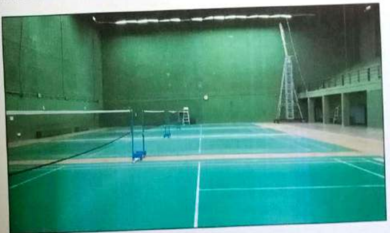
Figure 23: Badminton court