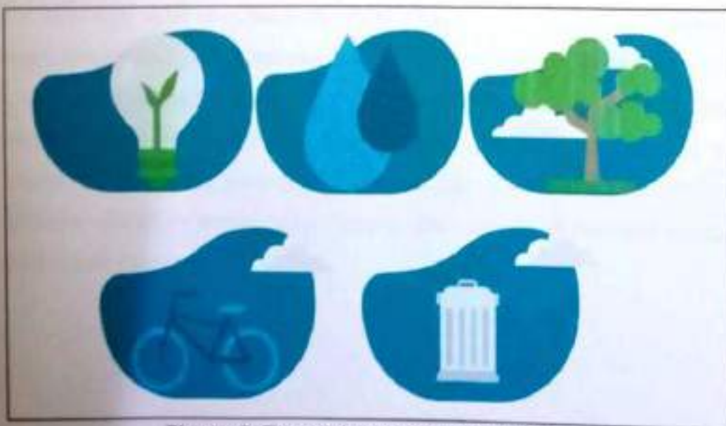
Figure 9: Target Areas of Green Audit