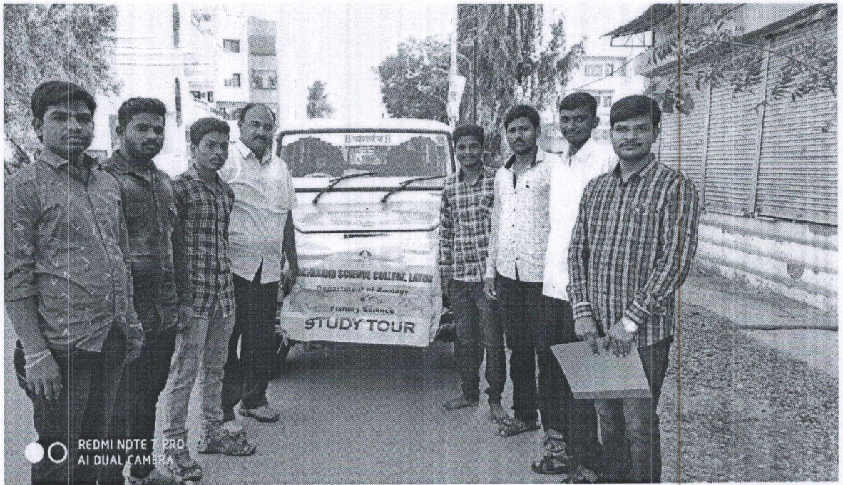
Teachers with student departure

Events organized during the Academic year