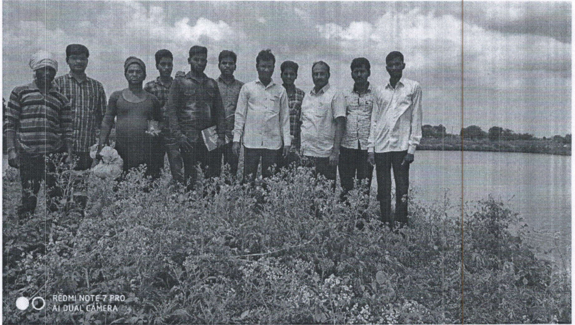
Observation of stocking pond

Events organized during the Academic year