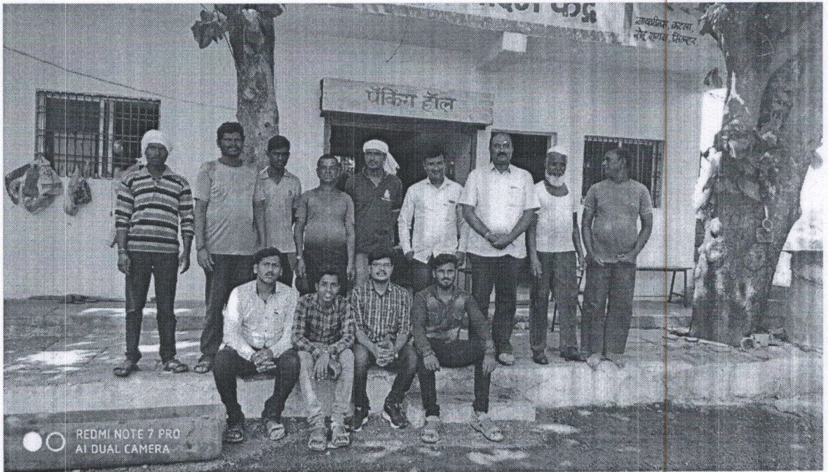
Manager and office staff of Maharashtra matsya beej Kendra

(Handwritten signature) PRINCIPAL Dayanand Science College LATUR