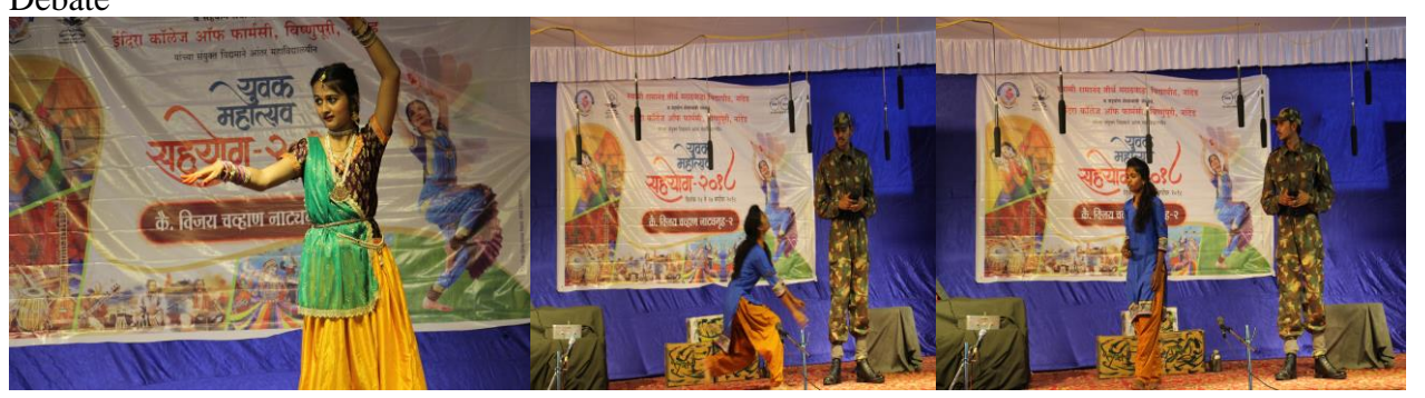
Student performing Classical Dance