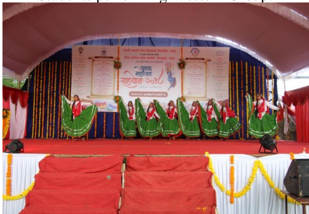
Students performing Dance