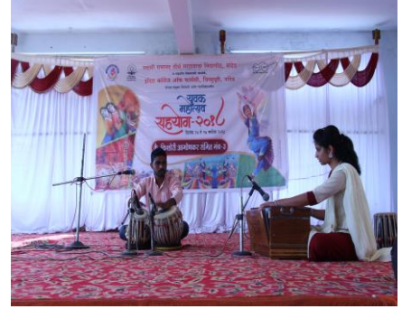
Student performing Classical Instrument Student performing