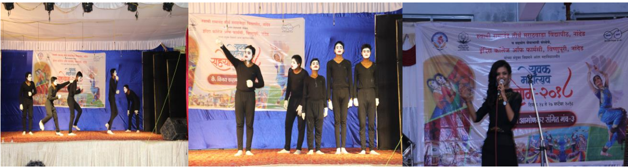
Student performing Mime