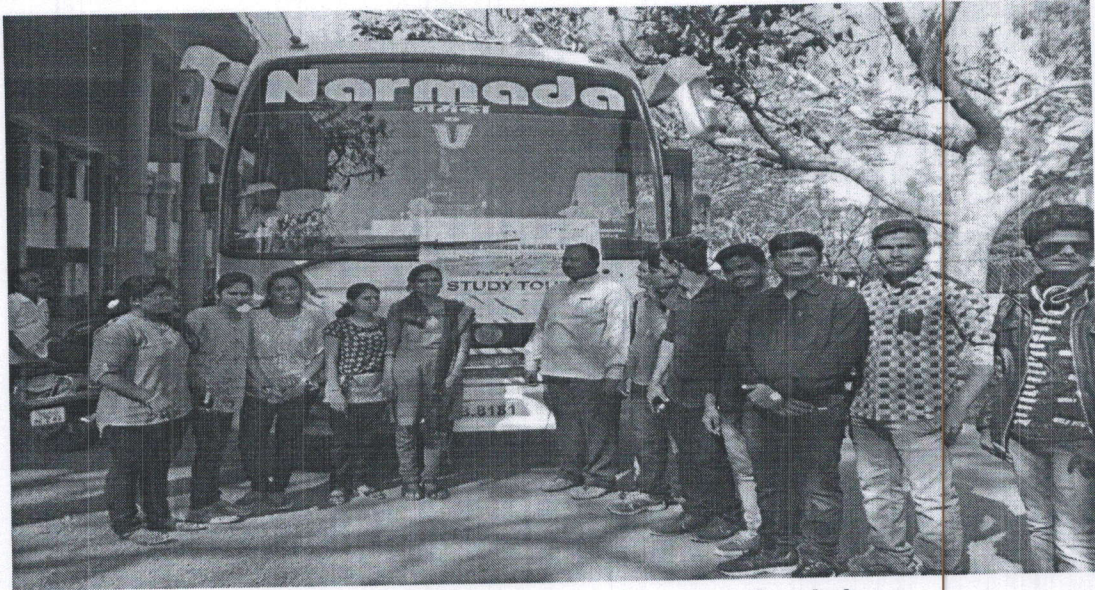
Teachers & student ready to departure for chakur