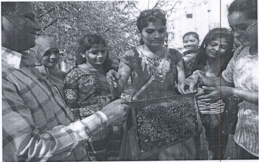
Demonstration of honeycomb, different types of honey bees